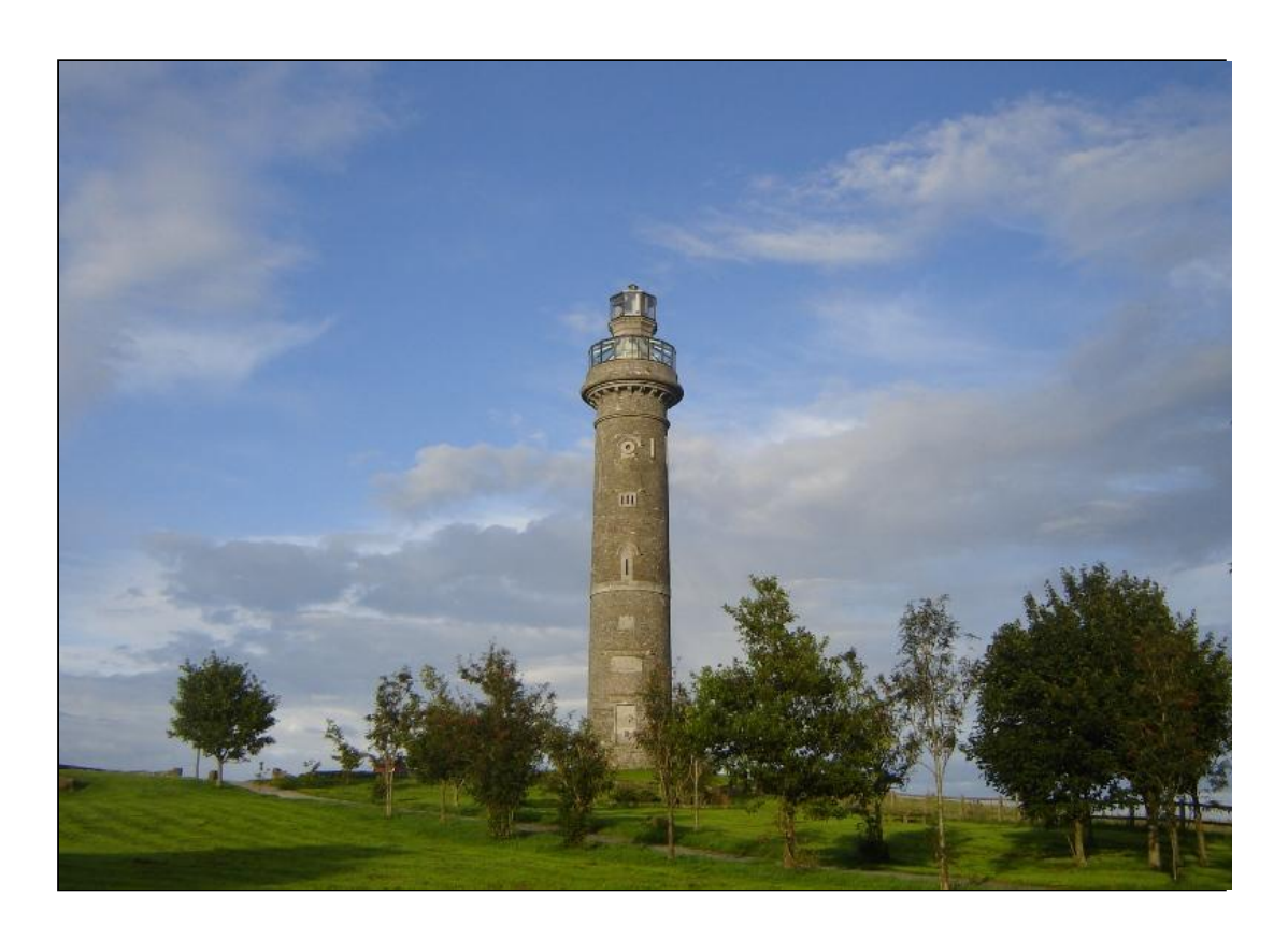
Plate 1 View of the Tower of Lloyd at The People's Park, near Kells